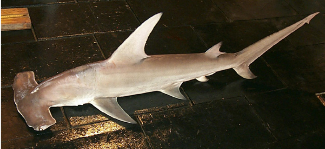
Figure 1. Great hammerhead.