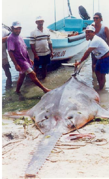
Largetooth Sawfish harvest

Even the species' last apparent hideout in Brazilian waters is threatened by fishing. According to the IUCN: