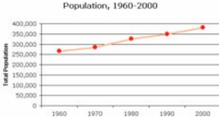
Figure 5: Human Population Growth in Corpus Christi, Texas.