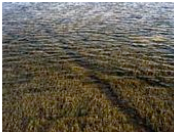
Figure 3: Propeller Scars Cut Across Seagrass Meadows in Corpus Christi.

The IUCN reports that this species could be extinct due to habitat loss (Roberts et al. 1998). Roberts and Hawkins (1999: 242) stated more than a decade ago that, “its habitat has recently been in rapid decline because of human activities at the coast.” Reasons for the Texas Pipefish’s disappearance related to habitat include destruction of submerged aquatic vegetation and dredging activities along the coast (Roberts and Hawkins 1999; Musick et al. 2000). As seagrass beds are considered to be a major habitat for the Texas Pipefish (Tolan 2008; NatureServe 2009), NMFS should consider seagrass degradation as a threat to this species’ survival.