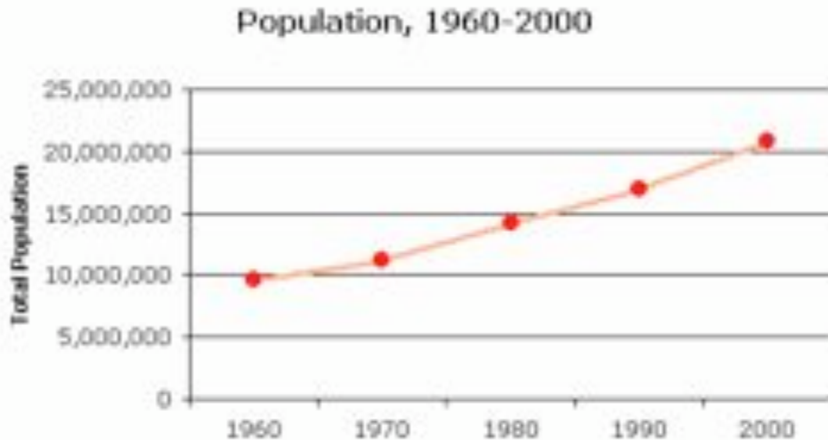
Figure 4: Human Population Growth in Texas.

The U.S has a higher population growth than almost every other developed country (United Nations 2007). Moreover, some of the coastal states in whose water this species is found have experienced exponential human population increases. For example, Texas and the Corpus Christi Bay area's populations have risen dramatically. See Figures 4 and 5.