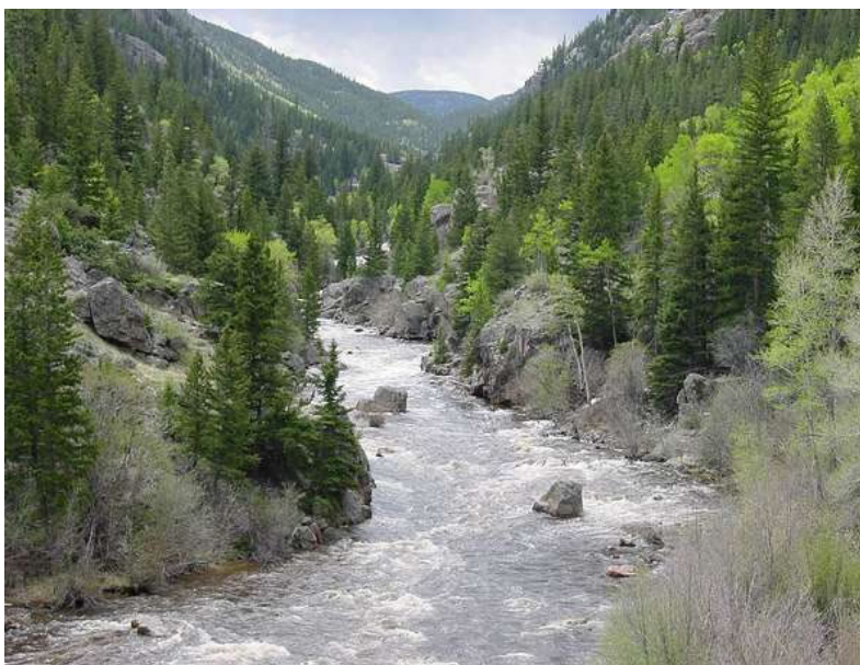
Photo of the Cache la Poudre River by Ellen Wohl. Two tributaries of the Cache la Poudre, Elkhorn Creek and Young Gulch, constitute the entire historic and current known range of the Arapahoe snowfly.