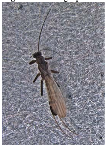
Figure 1. Photograph of Arapahoe snowfly adult by Boris Kondratieff.

Adult males of the Arapahoe snowfly belong to Decepta Group within the genus Capnia and have a slender epiproct (intromittent organ at the end of the abdomen) with horns on the tip; the epiproct is about 7 times as long as it is wide when viewed dorsally. Adults also have a distinct knob on tergum (dorsal or top portion) of the 7 th abdominal segment (Nelson & Baumann 1989). Females of the species were recently described from a single specimen collected at the type locality on Elkhorn Creek (Heinold & Kondratieff 2010). As the common name ‘snowfly’ suggests, the dark-bodied Capnia adults are adapted to winter conditions and emerge in late winter or early spring, often when snow is still on the ground (Stark et al. 1998).