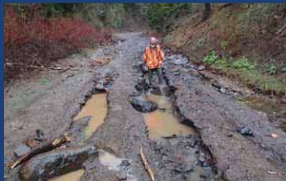
Damage from the April storms. A gullied wheeltrack where flood water was diverted down the road.

The data collected from GRAIP analyses on post-storm decommissioning sites clearly shows that road decommissioning, storm proofing and culvert upgrades have the potential to drastically reduce the legacy of road impacts from our forest road system. Legacy Roads and Trails funding provides important dollars for the agency to do just this type of work!