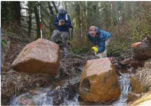
Technicians conducting a stream crossing pebble count as part of a post-decommissioning inventory.

GRAIP is being used in two types of case studies. The first assesses how effective the Legacy Roads and Trails program really is at correcting sedimentation and hydrologic problems. The second is an intensive watershed analysis of road impacts. All of the GRAIP research to date is based on actual field-data collected in every project area, along with some modeling estimates for baseline sedimentation rates. For the Legacy Roads and Trails studies, this entails collecting hundreds of data points. For the watershed analyses, tens of thousands of data points have been collected, with field crews literally walking every inch of road.