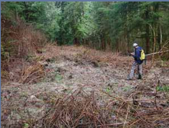
This Siuslaw National Forest road has been decommissioned.

The chart above (from Black et al. 2012b) shows how GRAIP can be used to profoundly increase effectiveness of the Watershed Condition Framework, Legacy Roads and Trails, and/or other road management efforts. Though nearly the same percentage of the road system will be treated, the project using a GRAIP survey (Scriver Creek, Boise National Forest) will reduce stream sedimentation by a far greater percentage than a theoretical project using standard methodologies.