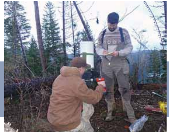
Installing a rain gauge on the Siuslaw National Forest.

The result of all this data collection? Legacy Roads and Trails is working! Road decommissioning is returning the land to near normal conditions, dramatically reducing the amounts of dirt entering streams. Stormproofing appears to be slightly less beneficial than road decommissioning, but that may change as more post-storm analyses are completed. Finally, the watershed analysis case studies have resulted in fascinatingly consistent data showing that a very small percentage of forest road mileage is causing a very large percentage of stream sedimentation.