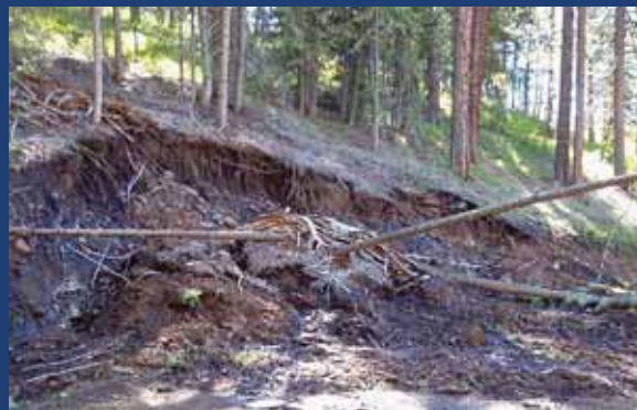
Cutslope failure along Mann Creek control road.