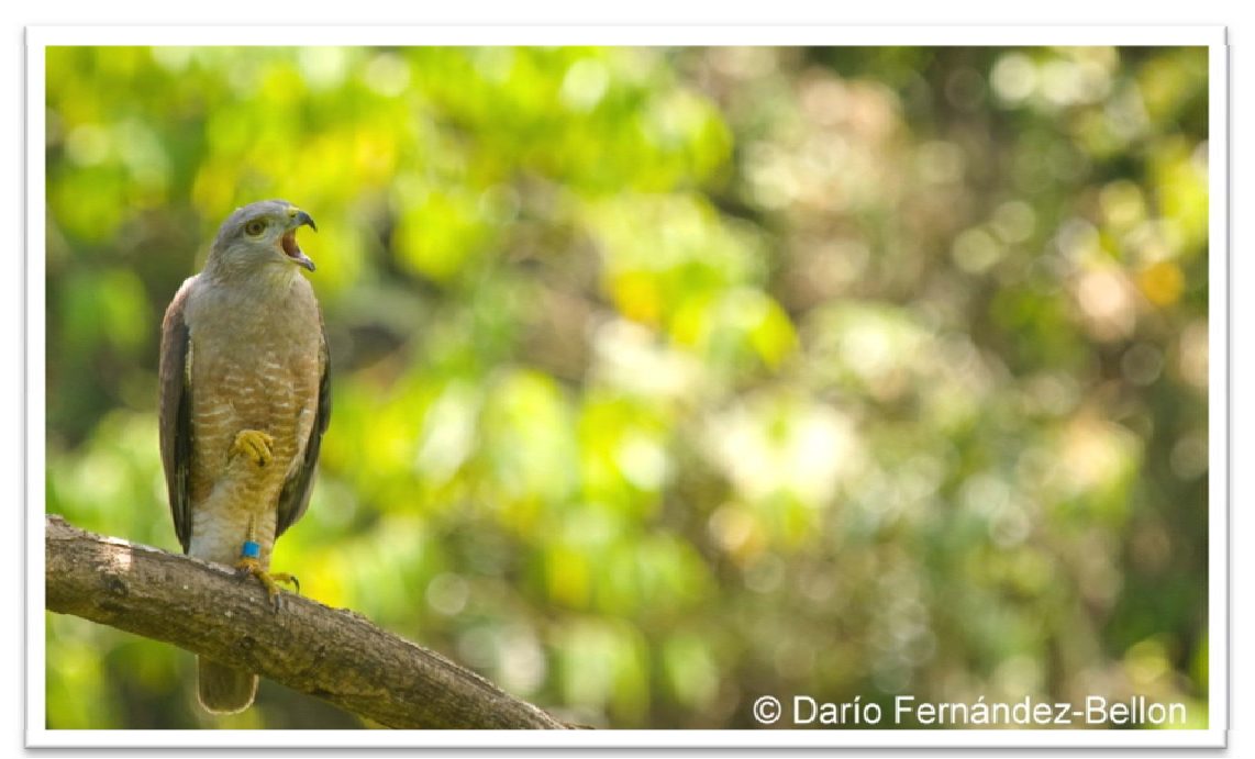
Male Ridgway's hawk calling. (Photograph used with permission)