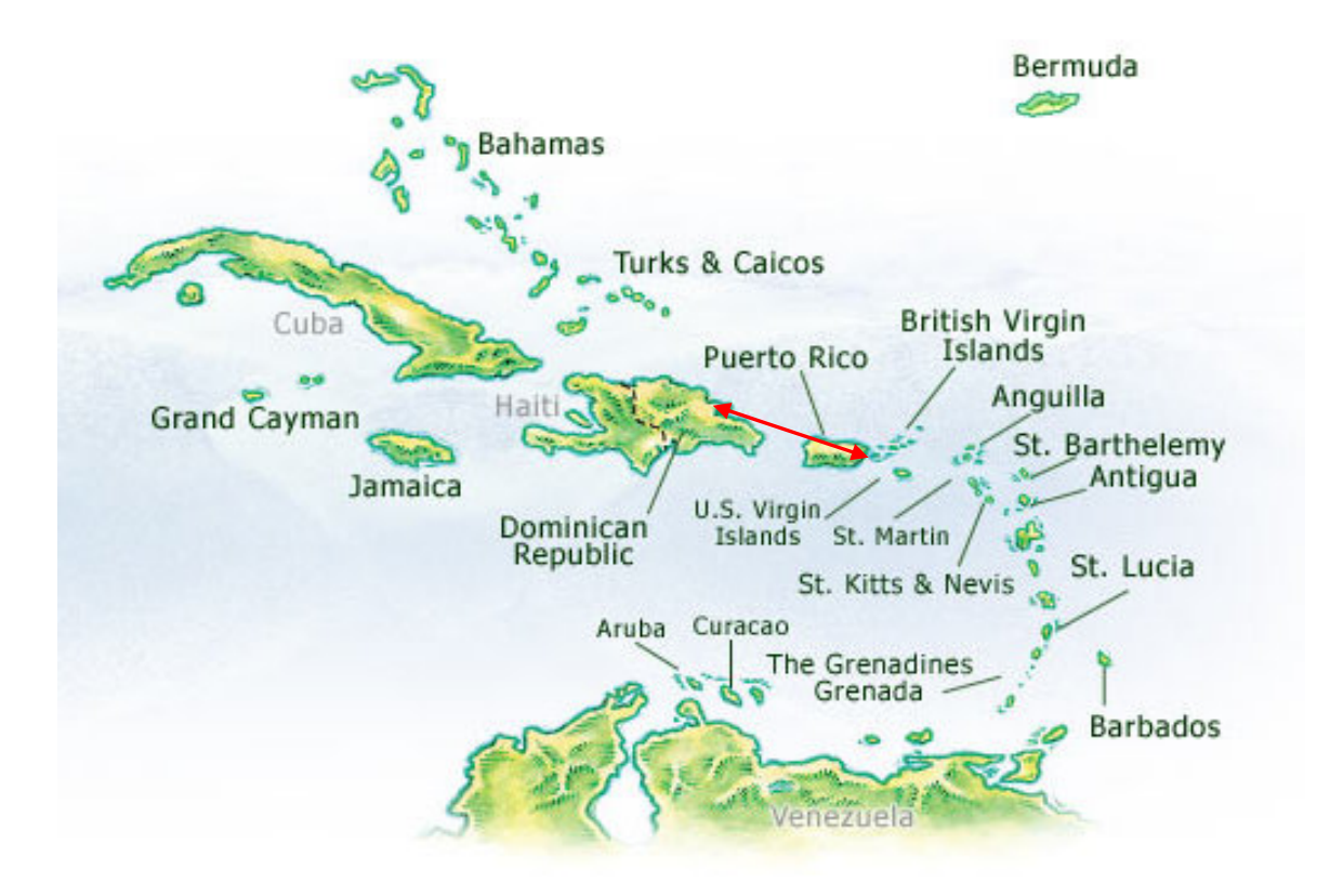
Figure 2. Map of the Caribbean. The red arrow depicts how Ridgway's hawks might have once used and/or perhaps still use or fly across Puerto Rico to reach Culebra (east) from the Dominican Republic (west).