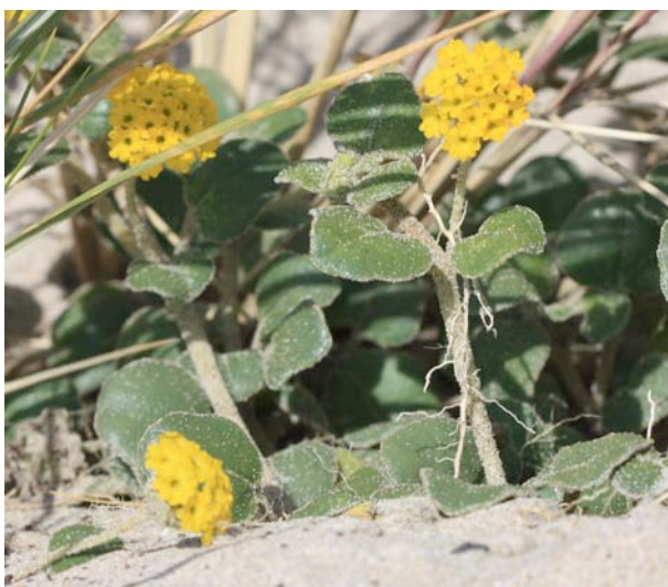
Figure 4. Yellow Sand Verbena Flowers and Leaves.

Adult Moths take flight from mid-May to early July, with a lifespan of 7-21 days. The adults fly once per year, at dusk or early evening. The flight season and mating peaks in mid-June, which corresponds to the peak flowering period of the yellow sand verbena. Adults deposit small groups of eggs or single eggs in the flowers of the yellow sand verbena. Larvae feed nocturnally on the verbena's flowers and leaves during the summer and subsequently enter dormancy (diapause) and overwinter from early fall to early spring. Diapause ends in early spring, at which time larvae continue feeding until they enter pupation in late April and May. Pupation takes place below ground in the sand, underneath verbena patches (COSEWIC 2003; British Columbia Invertebrates Recovery Team 2008). After a pupation period of approximately 10 days, adults emerge (SARA Registry 2009).