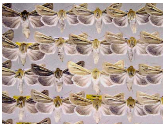
Figure 2. Color Range in Adult Sand Verbena Moth.

The Moth has exhibited a range of colors (Figure 2).