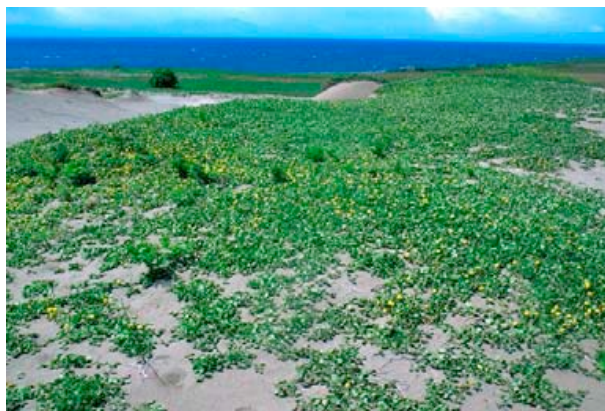
Figure 3. Dense Patch of Flowering Sand Verbena on Sandy Ridge.