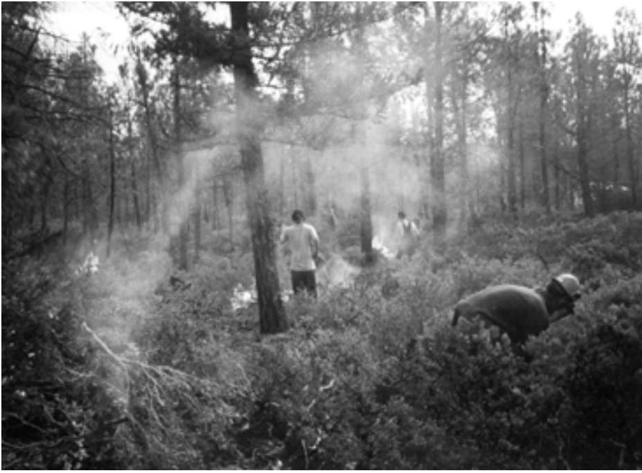
A fuel-reduction project in a fire-adapted, Jeffrey pine ( Pinus jeffreyi ) savanna on Rough and Ready Creek in southwestern Oregon. The project, which was organized by the Lomakatsi Restoration Project of Ashland, Oregon, includes small-tree thinning, lower-branch pruning, and brush pile burning. The project makes use of National Fire Plan funds for small tree and brush removal.

precedence where it is vital to eliminate or reduce the root causes of ecosystem degradation, including stopping destructive logging, road building, livestock grazing, mining, building of dams and water diversions, off-road vehicle use, and alteration of fire regimes (Appendix 1). Passive restoration can be applied alone or in combination with active restoration techniques provided that the primary goal is to stop the degradation and restore ecological integrity.