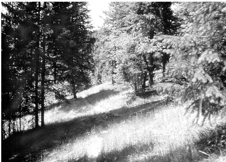
Road recontouring (middle of photo) along Grass Valley Creek in Redwood National Park, northern California, one year after project completion. The removal of roads and recontouring of slopes helps restore hydrological processes and aquatic health while reducing the effects of forest fragmentation.

Restoration must foster a sustainable human relationship to the land that promotes ecological integrity, social and economic justice for workers and communities, and a culture of preservation and restoration. In turn, effective restoration depends on strong, healthy and diverse communities and a skilled, committed work force. While the restoration principles provide the “ecological horse” for steering such an approach, the “economic cart” generated